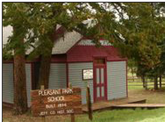
The Pleasant Park School was built in 1894 and has been authentically restored.

Don't have access to the Internet? Give CHSM a call: 720-333-0223