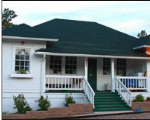
These photos are sold as notecards on the CHSM web site.