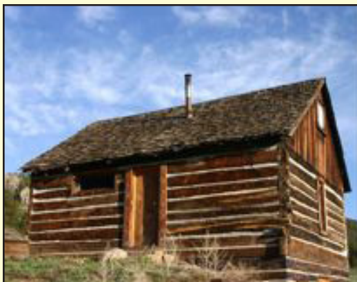
The History Channel's Mega Movers series featured the relocation of the Lubin-Blakeslee cabin.